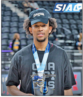
Morehouse Sports Photo