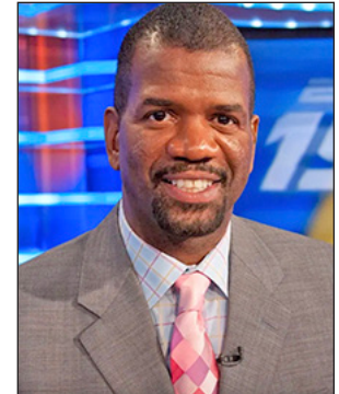
NEW HONORS, ROLES