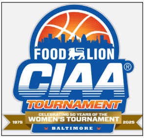
CIAA Women's Tournament logo