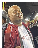
PARKER: CIAA title and two D2 playoff wins.