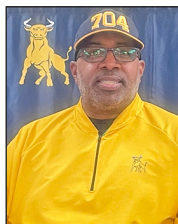
INTRIGUING MATCH UP IN CIAA