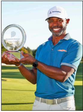
PGA Tour Champions Photo