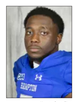
WARMING UP THE BUS