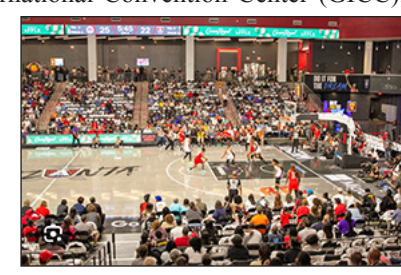
GATEWAY CENTER ARENA: Inside.

Additional information regarding ancillary events, tournament promotions and ticket sales will be released at a later date.