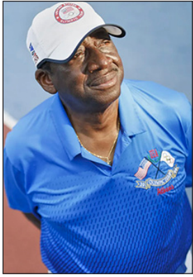
USA Track Photo