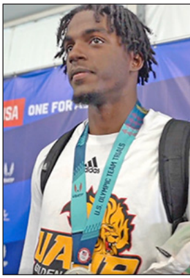
U. S. Olympic Trials Photo