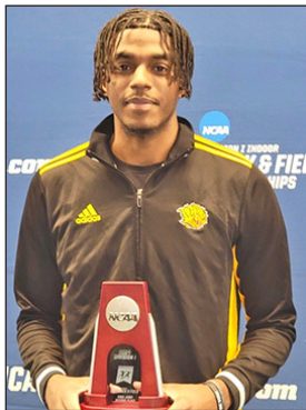
Arkansas-Pine Bluff Sports photo