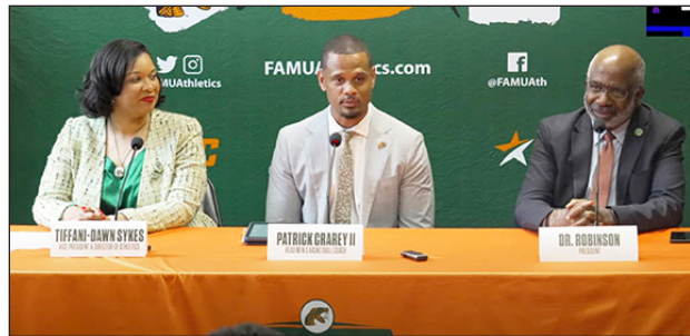
Florida A&M Sports Photo

WHAT'S GOING ON IN AND AROUND BLACK COLLEGE SPORTS