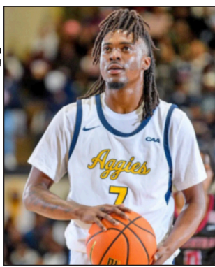
NC A&T Sports photos