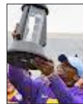
BERRY: Raises SIAC trophy again.